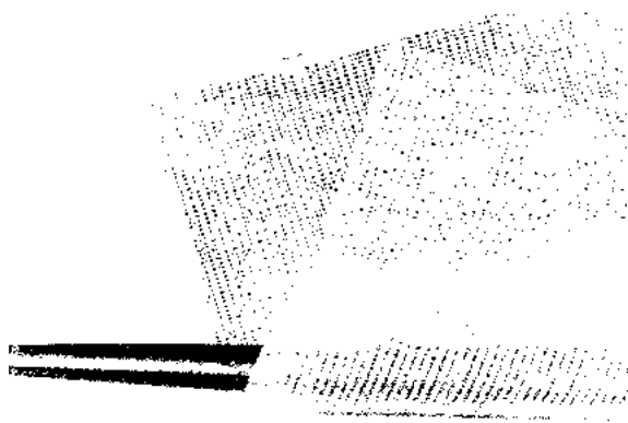
FIG. 1. The 0.175-mm thick Silastic sheet coated with Dacron mesh. The sheet is transparent enough that the wrapped forceps can be seen through it.

achieved even when clip application causes a tear in the aneurysm base. We actually had this experience in the wrap-clipping of a broad-based thin-walled aneurysm on the dorsal surface of the internal carotid artery. Another problem is that the toughness of the wall of a fusiform aneurysm often causes the clips to slide. In the wrap-clipping techniques, clips with a closing pressure sufficient to prevent sliding can be applied without fear of tearing the aneurysm from the parent artery. The Dacron mesh on the outer surface of the sheet helps to stabilize the clips.